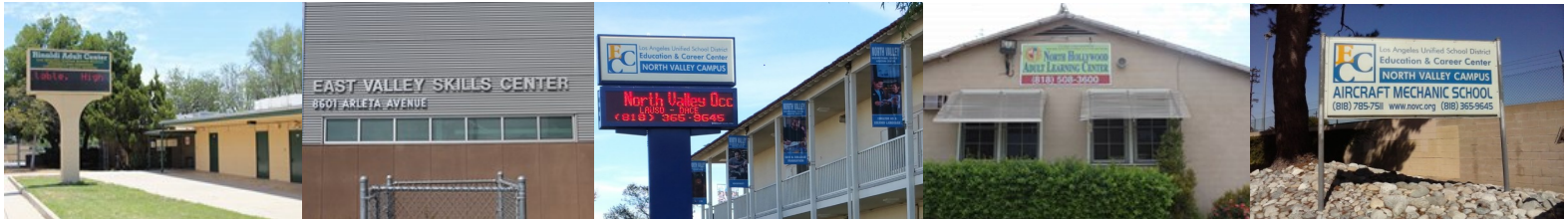
Message to NVOC Staff